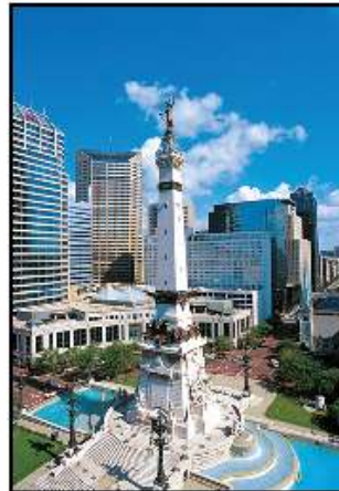
Soldiers' & Sailors' Monument Indianapolis, IN

Sheraton City Centre Hotel - Indianapolis, Indiana - February 28-29, 2008